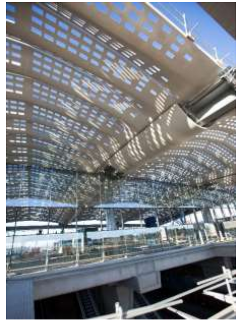
New high speed railway station © Fondeville