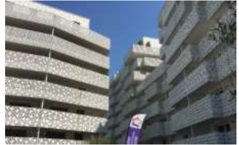
La Mantilla © Eiffage