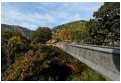
Angels Footbridge

The international conference UHPFRC 2017 will be held at Le Corum Congress Center in Montpellier from October 2 - 4, 2017. Le Corum is characterized by a unique and modern architecture. The building is dedicated to culture, business, science and combines in a single site the most modern techniques of a congress center. It is located just at the edge of the very historic city center at a 10 mn-walking distance from Montpellier-Saint Roch train station.