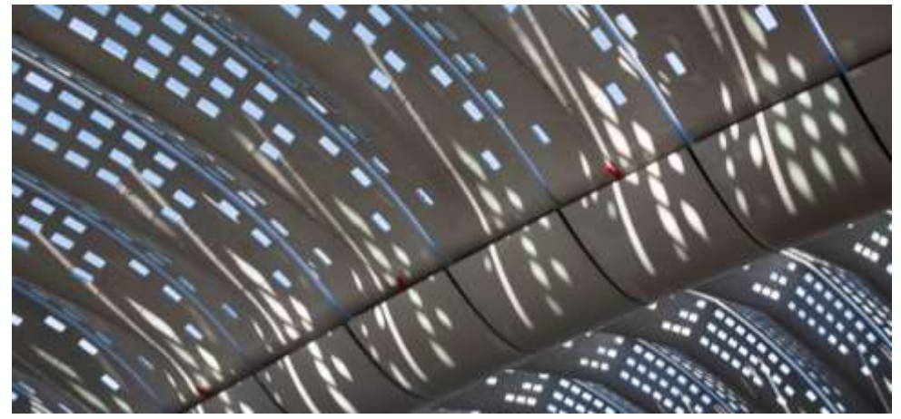
New high speed railway station